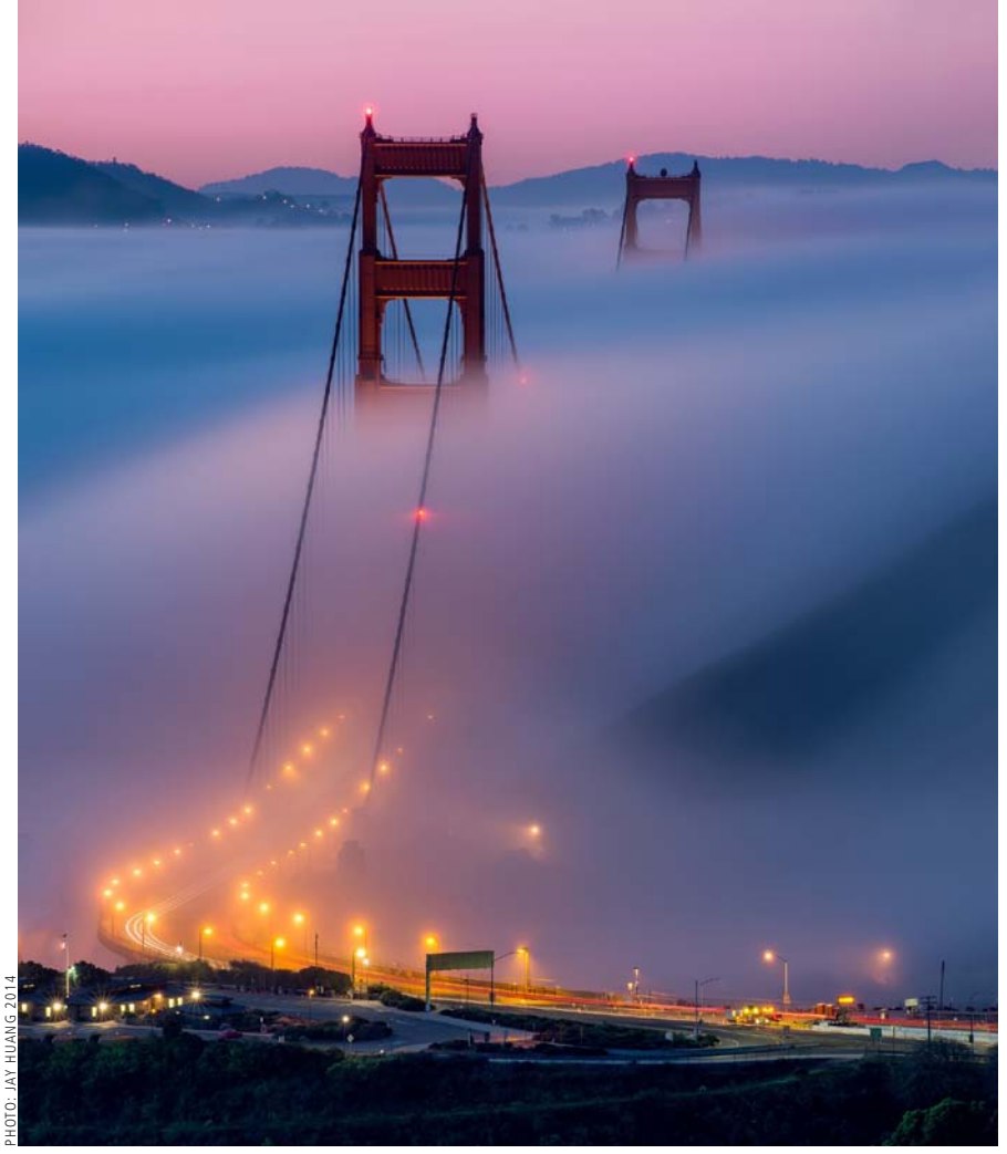
California coastal fog regularly flows in through the Golden Gate, obscuring the Golden Gate Bridge.

A comment offered during last year's public review of ANSI E1.23, Entertainment Technology—Design, Execution, and Maintenance of Atmospheric Effects, triggered an email exchange in which a commenter asked "... what ESTA's opinion is on the health effects of PM<sub>2.5</sub> and PM<sub>10</sub>, which are created by smoke and haze machines?" The commenter was not the first to ask about theatrical fog particle size, calling