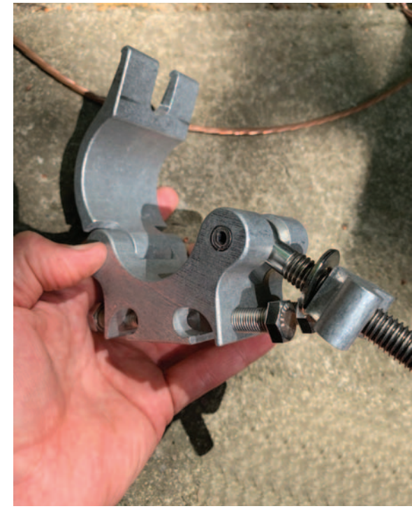
The Light Source Mega-Coupler Grounder allows you to bond pipe, truss, scaffold, and other conductive structures with a clamp that accepts #14AWG to 1/0AWG conductor.

It's rare that we see an electrical inspector on our entertainment stages, which is why the bonding of stages is not strictly enforced. That's not necessarily a bad thing as long as we can avoid accidents, and that means we need to anticipate them and be proactive about our safety practices, including taking steps to ensure that conductive materials are properly bonded.