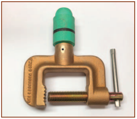
The KRE grounding clamp makes it easy to bond stages and structures.

People often ask how to properly bond a stage structure, truss, or other conductive materials. It starts at the generator or distro, and you can use a Camlock tee-connector