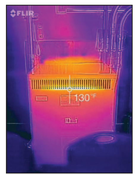
Figure 5 – An infrared camera can uncover hot spots in electrical apparatus that could indicate pending failure. If the equipment can't be de-energized for an IF scan, you can still get clues about the health of the apparatus.

readings. Depending on the circumstances, it might be difficult or impossible to take measurements or to take them at peak load. But the closer to peak load you can get, the more telling your results will be.