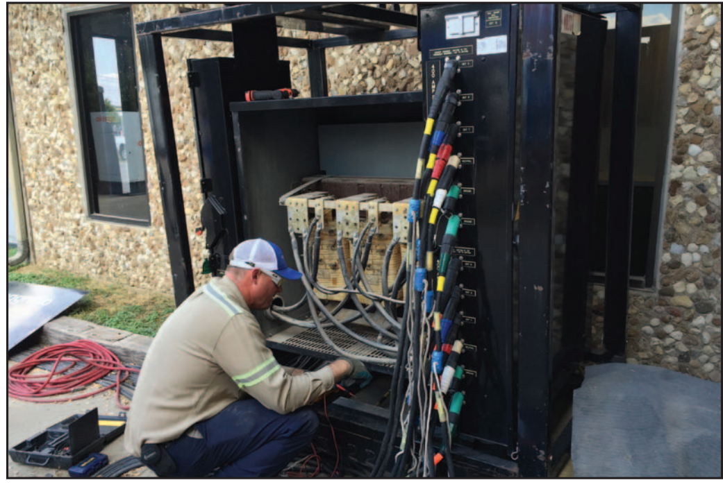
Figure 1 – A transformer that hums loudly and produces a lot of heat with no load connected to it is very likely failing. This power tech attempted a diagnosis after de-energizing the generator and transformer.

But that episode drove me to do further research, which continues to this day. I've looked through engineering books, lighting books, and I've talked to friends. And one of the best resources I've found on the subject comes from what I would have not