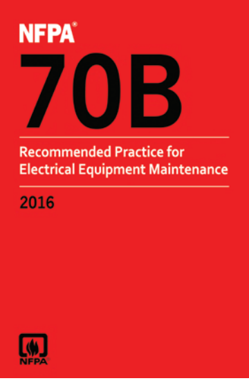
Figure 2 – NFPA 70B contains a lot of very useful information that can be used to help prevent failure of electrical apparatus and prevent accidents.

You can buy the softbound version or the PDF version for $82 and you can also get free online access at the NFPA website. The 2016 edition has 35 chapters and 17 very